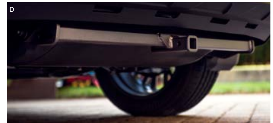
A. NX Roof Rack B. 18" Gloss Black Machined Alloy Wheel C. Puddle Lamp D. NX Activity Mount