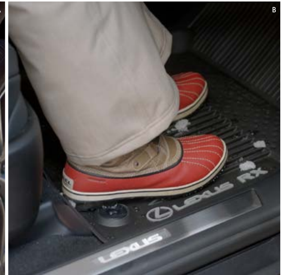
A. Mud Guard B. RX All Weather Floor Liners